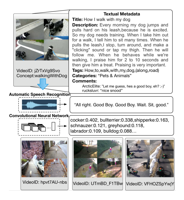
Figure 2: Multi-modal prior knowledge from web videos.

workflow of our system. Our system will first collect related videos from popular video hosting sites like Youtube by using their text search engine and combine these videos to our own video dataset. Then it mainly involves two procedures, curriculum design and model training, to learn multimodal video detectors.